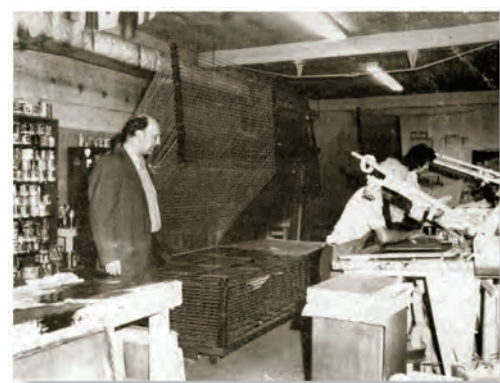
Custom graphics since 1957.

We are one of the largest and most modern screen printing/digital plants in the Mid-Atlantic region, but small enough to always be attentive to your printing needs. The 38,000 square foot facility was custom built to produce quality screen printed products and digital graphics.